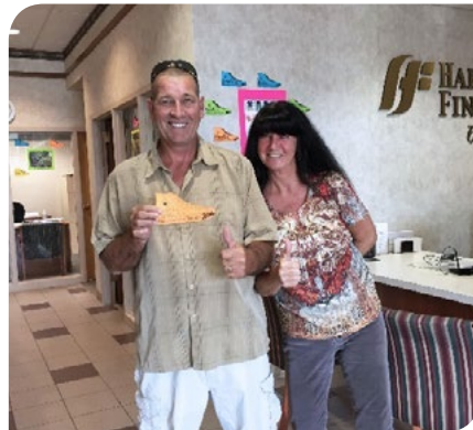
Indy staff pictured with people donating to the Hydrocephalus Association