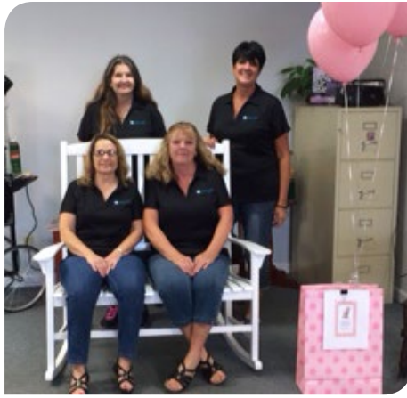
Shelbyville staff pictured on rocking chair

We raised a total of $850 to the Shelby County Cancer Association this year thanks to our members and staff. We appreciate all of those that came out to our Shelbyville branch to donate!